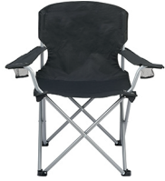
PRODUCT SCALE: 25% Back panel